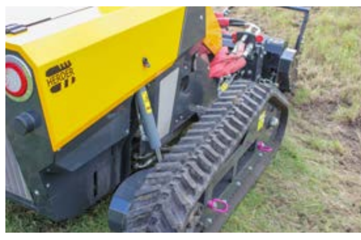
Hydraulic pendulum / adjustment cylinder