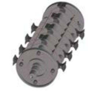
Forestry rotor with flails that can be rotated 360 ° for grass, branches and shrubs up