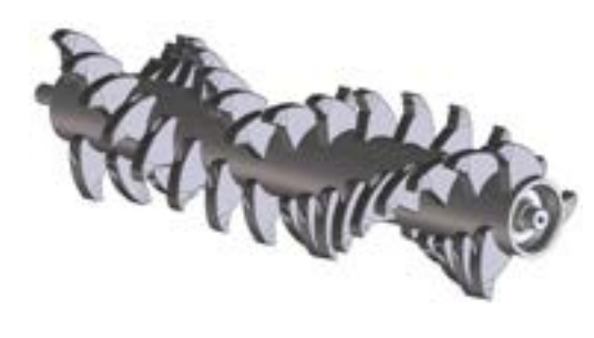
Forestry rotor with fixed chisels for branches and shrubs up to Ø10-12 cm