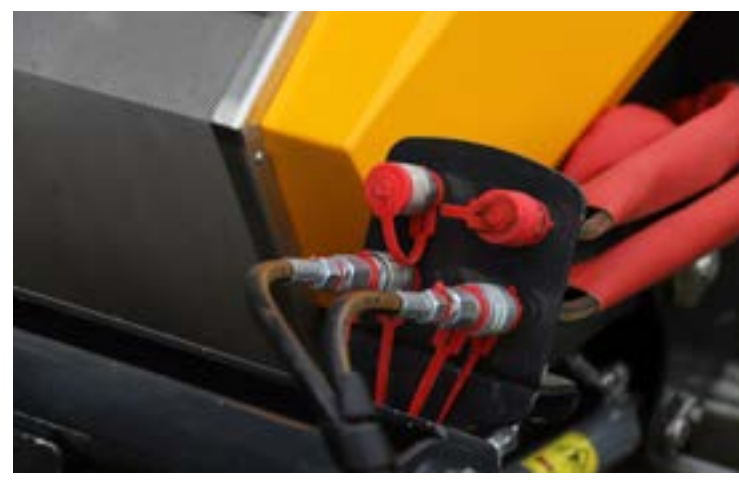
Various (hydraulic) connections are standard