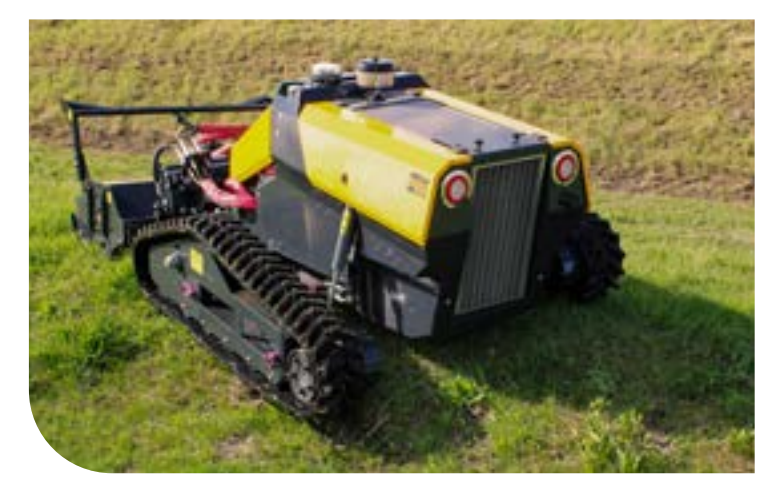
Independent swinging tracks for optimal ground following and grip