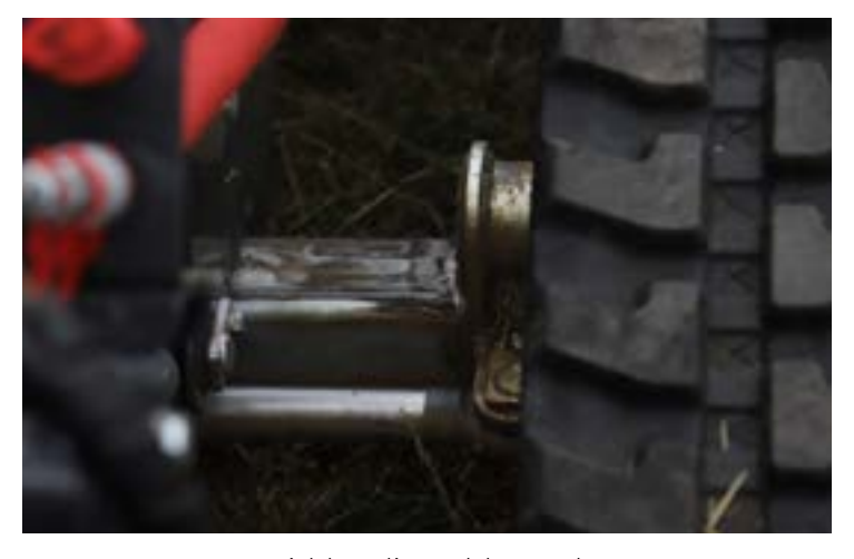
Width adjustable tracks