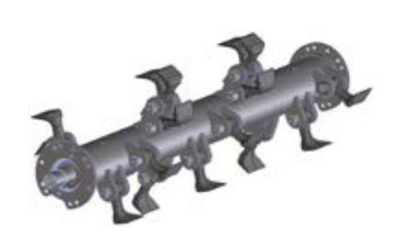
Standard flails for grass, branches and shrubs up to Ø6-8 cm

With the Flail Mower you can choose from 3 different types of rotor shafts. Each rotor shaft has its own qualities, properties and application. Of course, you can always contact one of our experts, for further information and advisement.