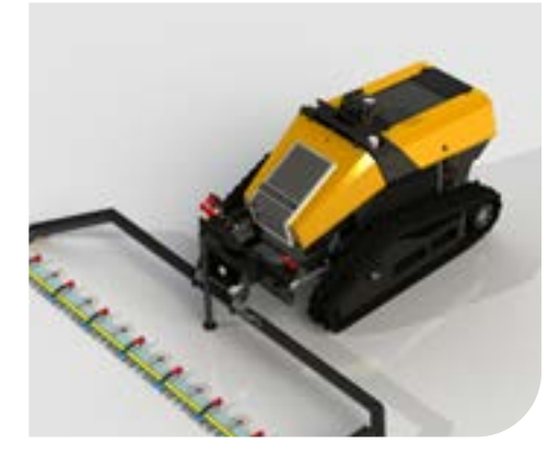
Portal mower with cutter bar